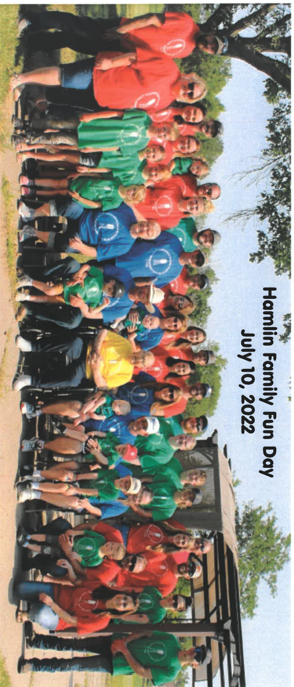
Hamlin Family Fun Day July 10, 2022